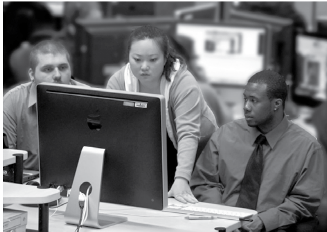
HNFE students use a variety of resources to prepare themselves for evolving communication and technology, such as Innovation Space – a Virginia Tech multimedia center.